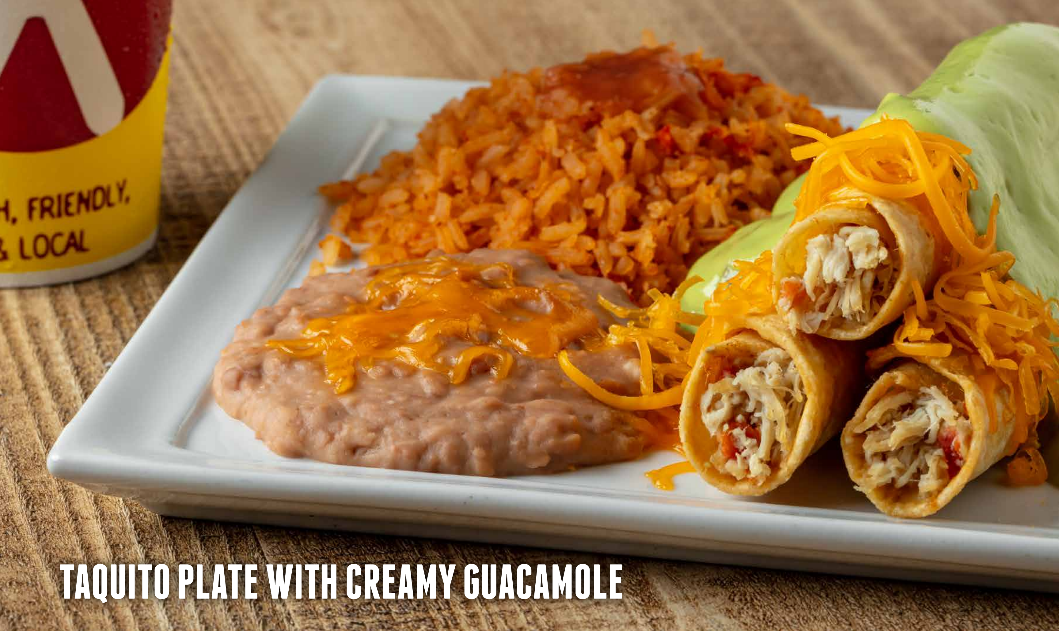
TAQUITO PLATE WITH CREAMY GUACAMOLE